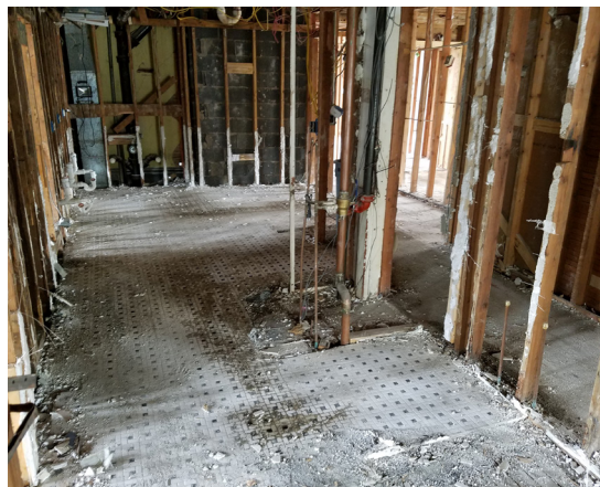
Demolition of 2nd floor bathroom