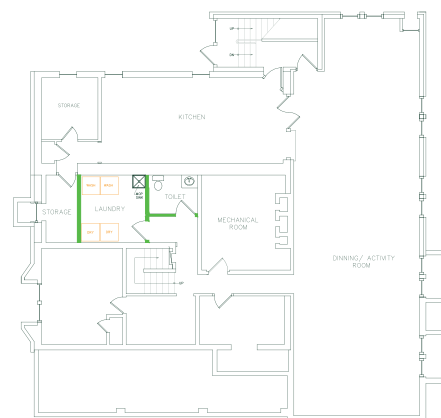
Basement Floor Plan "Laundry / Toilet"